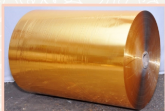
FLORA METALLIC POLY FILM ROLL