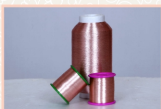
50/D POLYESTER JARI THREAD