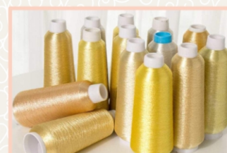
210/D POLYESTER JARI THREAD

“ विश्वास आपका जिम्मेदारी हमारी ” " YOUR TRUST IS OUR RESPONSIBILITY "