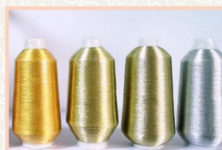
180/D POLYESTER JARI THREAD