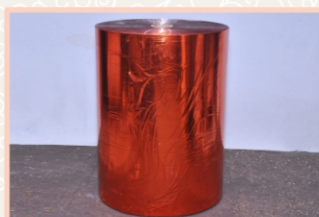
INDIAN METALLIC POLY FILM ROLL