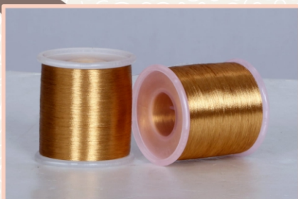
30/D NYLON JARI THREAD

“ विश्वास आपका जिम्मेदारी हमारी ” " YOUR TRUST IS OUR RESPONSIBILITY "