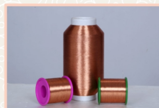
70/D POLYESTER JARI THREAD