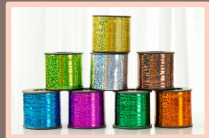
MULTI METALLIC YARN