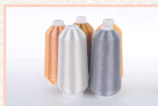
150/D POLYESTER JARI THREAD