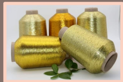
MX BADLA JARI THREAD