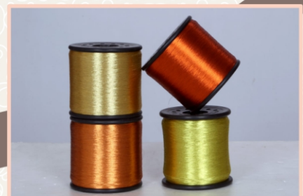
70/D JUMBO ROLL